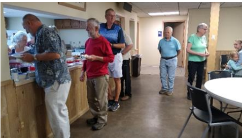
The ladies of the church honored fathers with pies for coffee time while celebrating Father's Day.