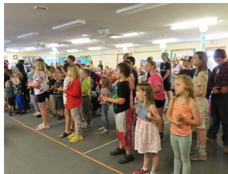
(Continued on Page 5)