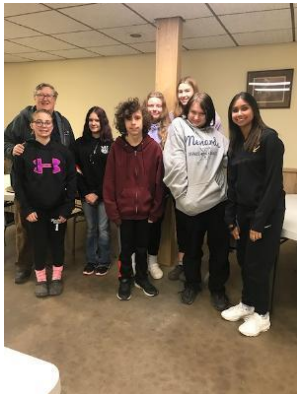
High School Release Time