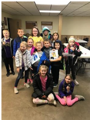
Elementary Release Time