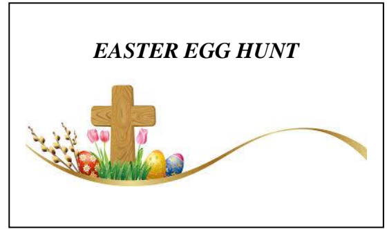
About 30 children plus adults participated in the Easter Egg Hunt sponsored by the Hope Youth group.