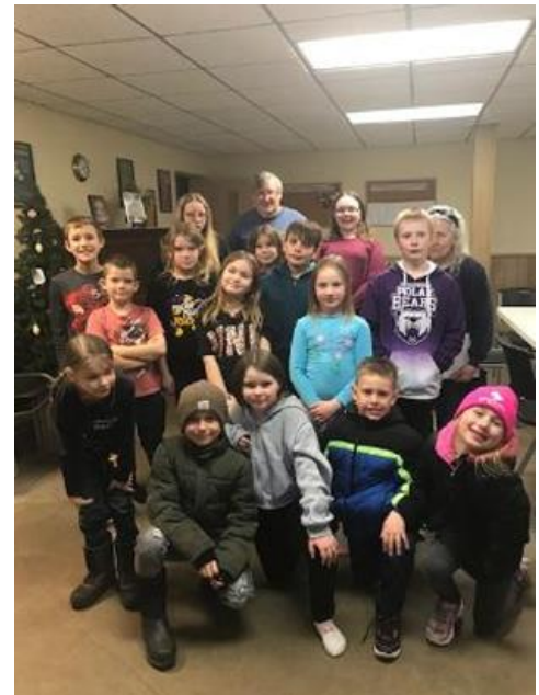
Elementary School Release Time class