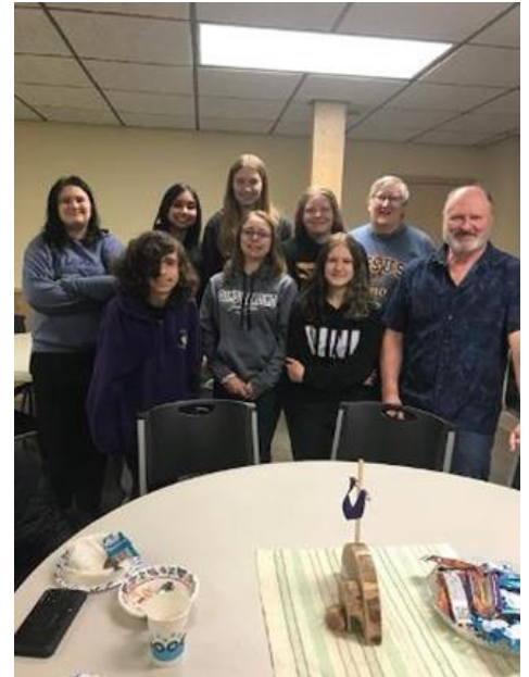
High School Release Time class.