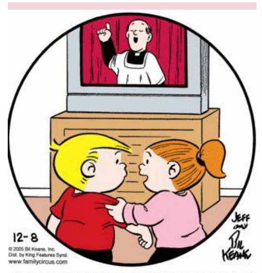
"Hear that? People in heaven have ever-laughing life."