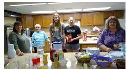
Youth help with Lenten Soup Suppers. Thanks to adults and youth.