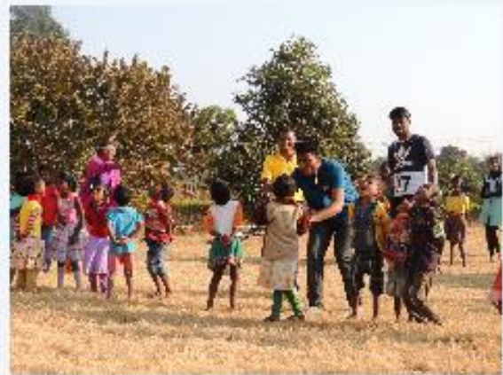
Students organizing sports events for after school children in the seminary campus.

Students, Faculty and the guests from US on the occasion of the dedication of this residential building on Dec. 31, 2017.